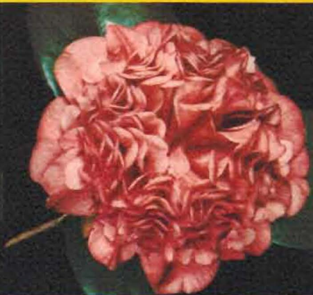
Professor C. S. Sargent