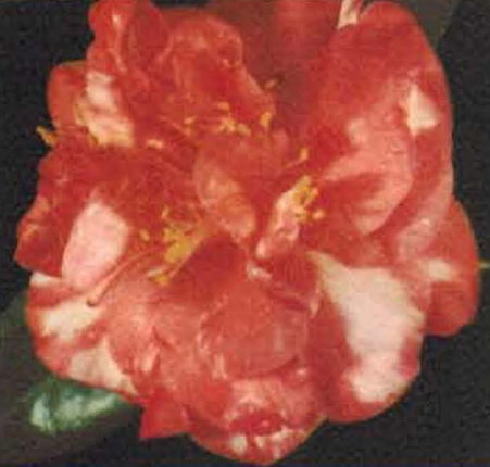
Pride of Houston